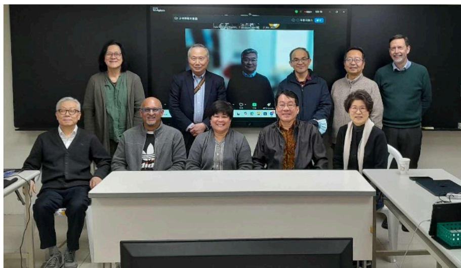
The ATA Executive Board

This year, ATA has been blessed with the privilege of collaborating with several organizations, working together to strengthen our member institutions. First, we continued to work with TearFund East and Southeast Asia and with them organized a couple of gatherings toward the end of helping our member institutions incorporate Integral Mission in their formative efforts. With them we organized the Church and Community Mobilization (CCM) workshop- a key component of ATA's partnership with the aforementioned. Through the CCM workshop, "the participants looked into the theological framework of pursuing 'life in all its fullness,' several models of how to bring about this vision in local communities, and the process of outworking CCM in the particular context of Mongolia." Then we also organized year 2 of Equipping Leaders for Integral Mission, a by invitation only gathering of about 30 leaders from across East and Southeast Asia. But more than just events, through our partnership with TearFund East and Southeast Asia, we were also able to award scholarships to three doctoral students for their dissertation data gathering! We hope to continue to provide scholarships to more post-graduate students across East and Southeast Asia through our partnership with TearFund. In fact, we are calling for new applications! These scholarships are available particularly to ThM, Dmin, and PhD students whose research is in the area of Integral Mission and are