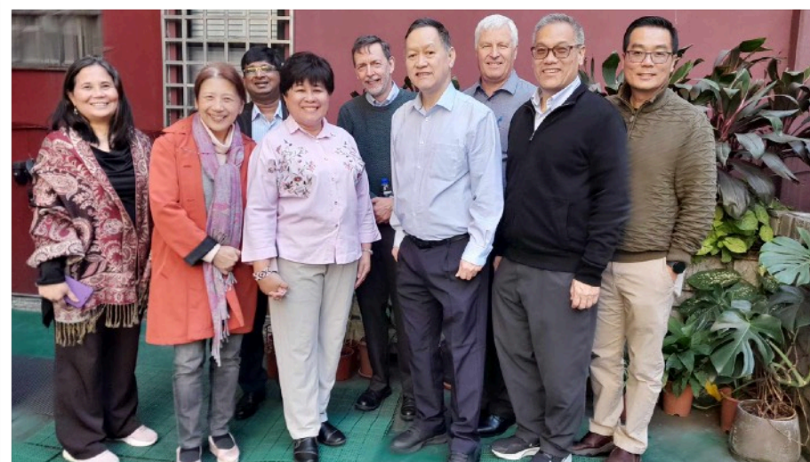
Commission on Accreditation and Educational Development (CAED)

enrolled in ATA- Accredited schools in the said region. ( See announcement on page 9 ).