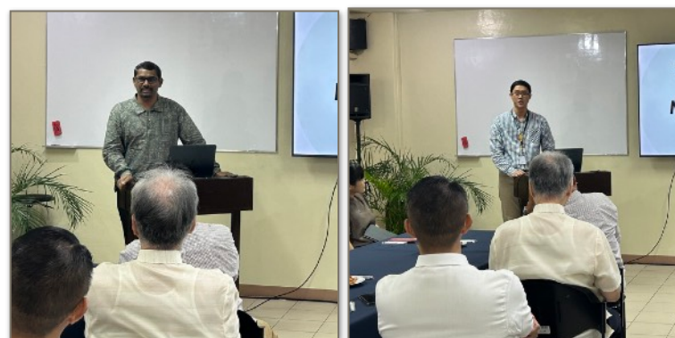
CTIA's junior fellows share their experiences working in CTIA, along with their hopes for the research center.

responses- and CTIA will as part of its commitment in this partnership.