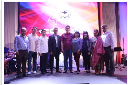
Guests enjoyed fellowshiping with one another on this joyous