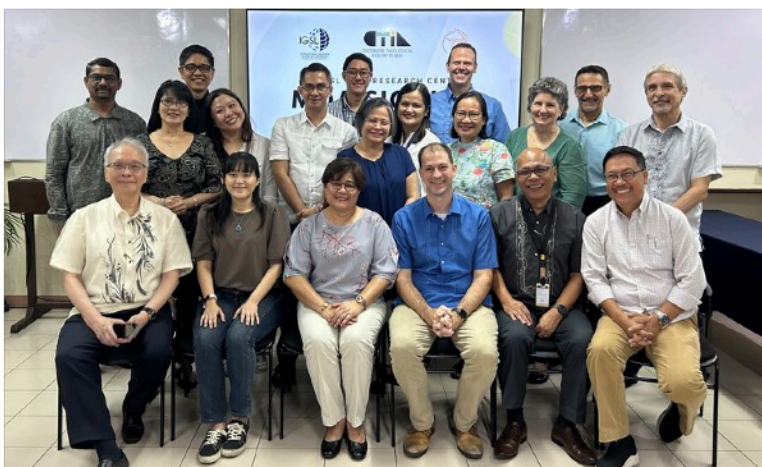
CTIA leaders and guests rejoice, together, celebrate the launching of CTIA!