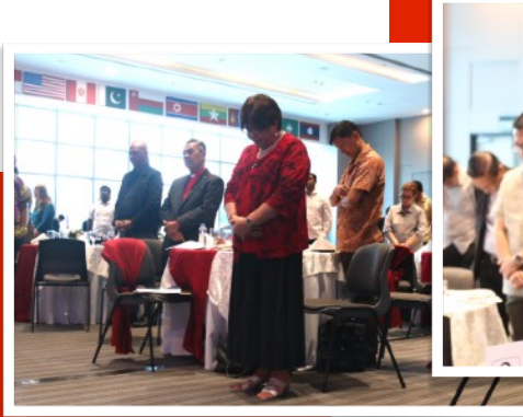
Leaders and guests together prayed for AGST PH and its ministry.